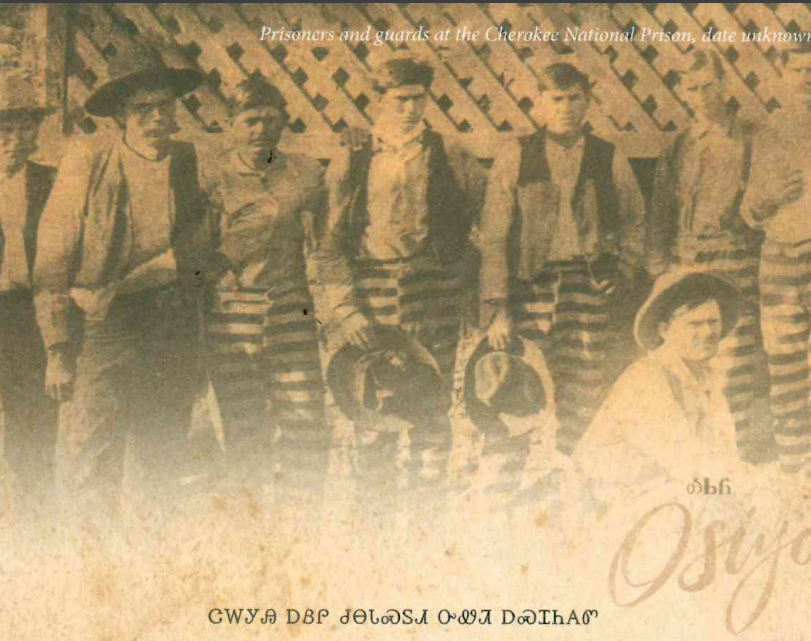
Prisoners and guards at the Cherokee National Prison, date unknown