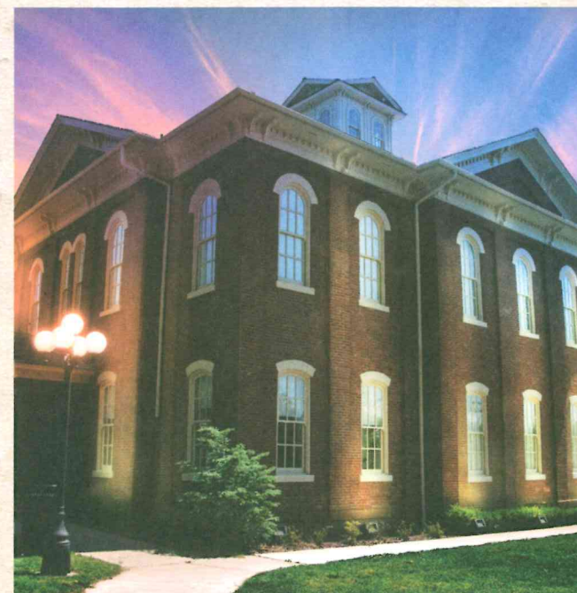
Cherokee National History Museum

Hours: Tuesday - Saturday 10 a.m. - 4 p.m. 22366 S. 530 Rd. | Park Hill, OK 74451